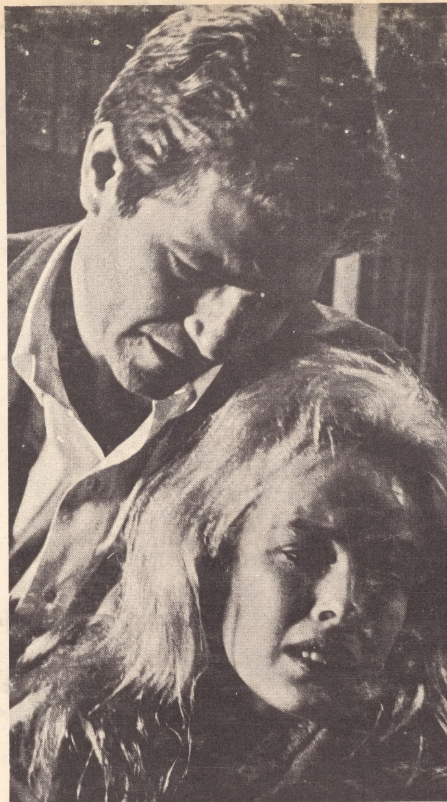
GEORGE SEGAL & SANDY DENNIS